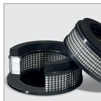
H13 HEPA Filtration Module (EN1822)