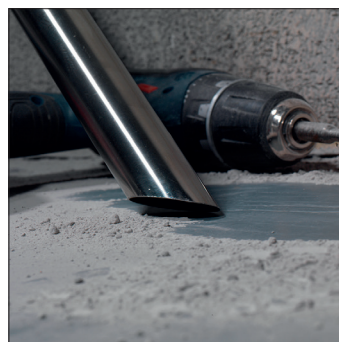
Stainless Steel Gulper / Scraper Tool