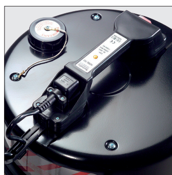
Plugged Easy Cable Change